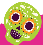
Table must be vacated 90 minutes after arrival all drinks must be consumed within that time. All guests at the table must be eating from the Bottomless Brunch menu, mix and match is not available.